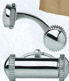
Leave him a secret message in the detachable scroll Sterling silver cuff links, LINKS OF LONDON, $275, visit linksoflondon.com