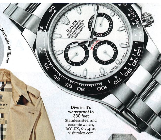
Dive in: It's waterproof to 330 feet Stainless steel and ceramic watch, ROLEX, $12,400, visit rolex.com