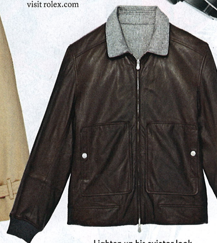
Lighten up his aviator look Men's reversible leather and wool-blend jacket, BRUNELLO CUCINELLI, $4,995, at Brunello Cucinelli, NYC