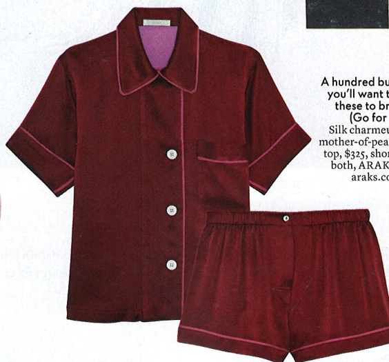
A hundred bucks says you'll want to wear these to brunch. (Go for it.) Silk charmeuse and mother-of-pearl pajama top, $325, shorts, $155, both, ARAKS, visit araks.com