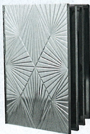
A shiny vessel for eight of your brightest moments Sterling silver photo album, MONICA RICH KOSANN, $8,350, visit monicarich kosann.com