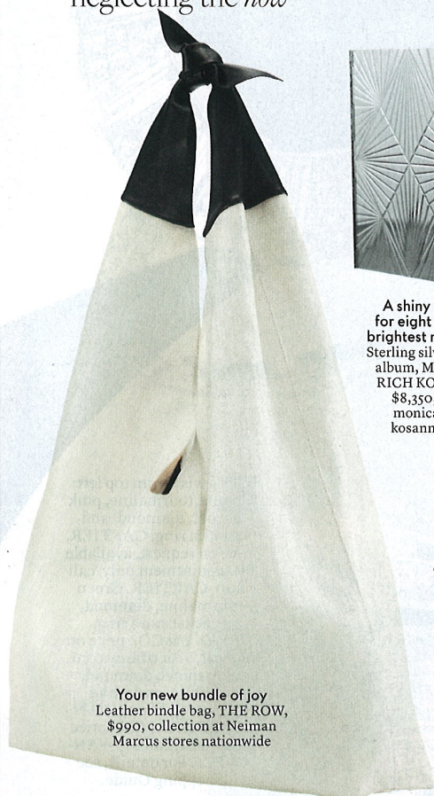
Your new bundle of joy Leather bindle bag, THE ROW, $990, collection at Neiman Marcus stores nationwide

Embrace time-tested staples without neglecting the now