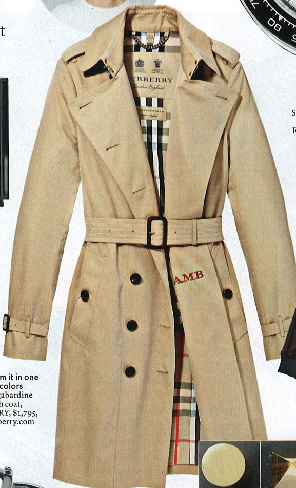
Monogram it in one of 15 colors Cotton gabardine trench coat, BURBERRY, $1,795, visit burberry.com