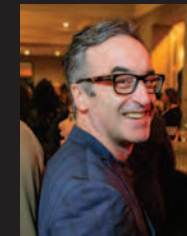
Presenter Don McKellar