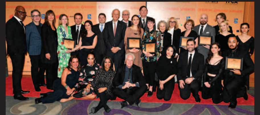
Award winners, presenters and sponsors